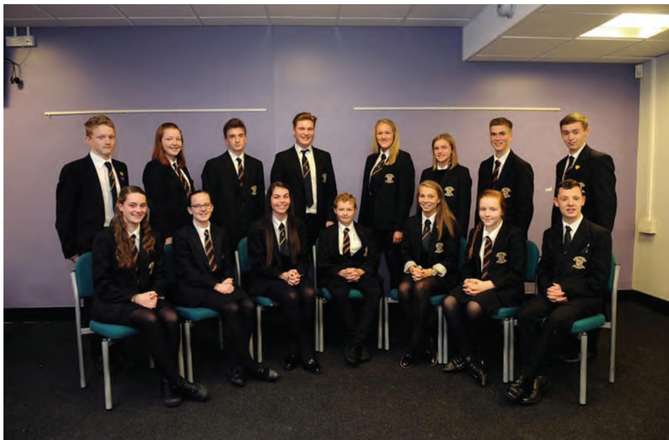
Bearsden Academy students were pleased to attend the event.