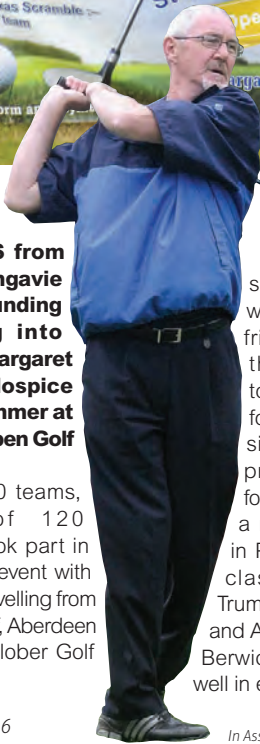
Hospice' supporters swung into action

SUPPORTERS from Bearsden, Milngavie and the surrounding areas swung into action for St Margaret of Scotland Hospice earlier this summer at the first ever Open Golf Competition.