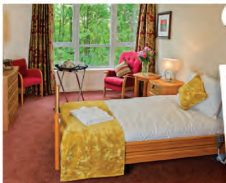
Antonine House Suite

Offering high quality, personalised nursing