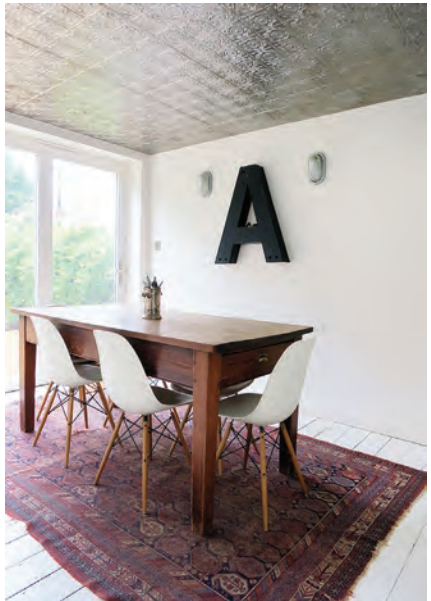
An antique Afshar rug from south-east Iran placed in modern dining area - a perfect mix of old meets new

Little-Persia 11-13 Commerce Street Glasgow G5 8AB 0141 420 6989 www.little-persia.com