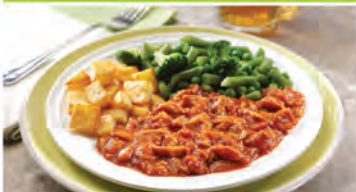
611 - Barbecue Pulled Pork

7 Main Courses with vegetables: • Barbecue Pulled Pork • Chicken & Chorizo Casserole • Chicken with Tomato & Basil Sauce • Mediterranean Fish Casserole • Lamb Tagine • Chicken & Spring Vegetable Casserole • Cumberland Sausages 3 Desserts: • Blackcurrant & Clotted Cream Ice Cream • Lemon Sponge • Pineapple Upside Down Cake