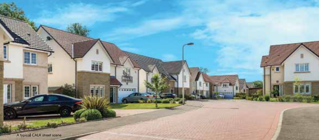
A typical CALA street scene