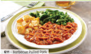
611 - Barbecue Pulled Pork

7 Main Courses with vegetables: • Barbecue Pulled Pork • Chicken & Chorizo Casserole • Chicken with Tomato & Basil Sauce • Mediterranean Fish Casserole • Lamb Tagine • Chicken & Spring Vegetable Casserole • Cumberland Sausages 3 Desserts: • Blackcurrant & Clotted Cream Ice Cream • Lemon Sponge • Pineapple Upside Down Cake