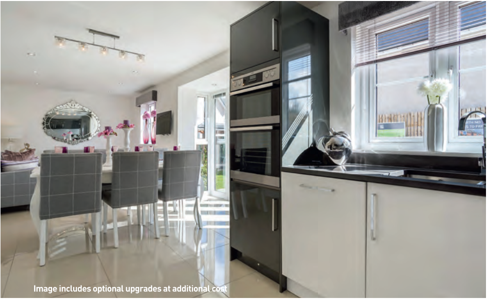
Image includes optional upgrades at additional cost