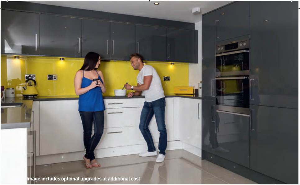
Image includes optional upgrades at additional cost