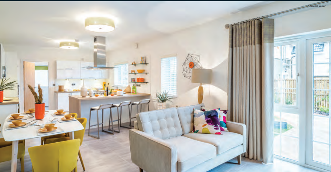
A typical Logan

A RANGE OF LUXURY 4 & 5 BEDROOM DETACHED HOMES