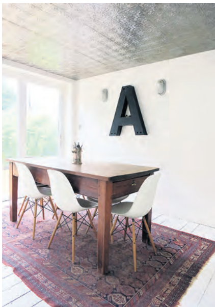
An antique Afshar rug from south-east Iran placed in modern dining area - a perfect mix of old meets new

Little-Persia 11-13 Commerce Street Glasgow G5 8AB 0141 420 6989 www.little-persia.com