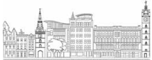
Merchant City & Trongate Community Council

For more information, email the committee on merchantcity.cc@gmail.com .