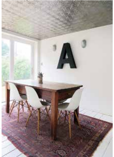
An antique Afshar rug from south-east Iran placed in modern dining area - a perfect mix of old meets new

Little-Persia 11-13 Commerce Street Glasgow G5 8AB 0141 420 6989 www.little-persia.com