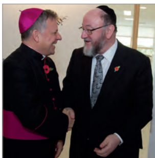
The Catholic and Jewish faiths come together on one campus

to be part of the official opening ceremony at this state-of-the-art campus which will support fabulous learning experiences for all of its pupils.