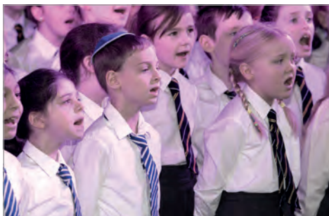
Talented pupils from both schools performed