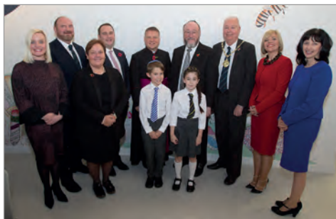
Religious figures joined the school community