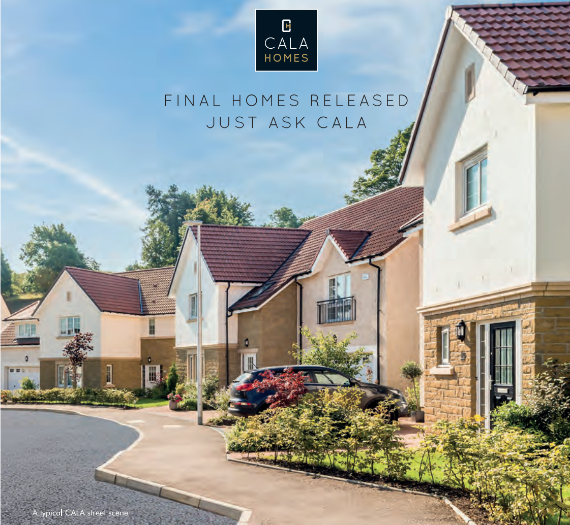
A typical CALA street scene

Rosegarth Wynd Capelrig Road Newton Mearns, G77 6LA