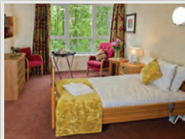
Antonine House Suite

Offering high quality, personalised nursing care in a homely environment