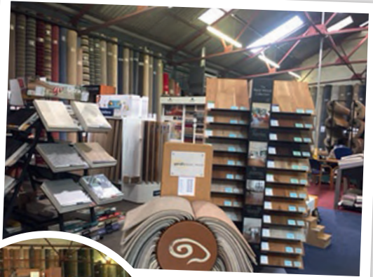
Make the most of a huge range of styles in store

And with the festive season fast approaching there has never been a better time to think